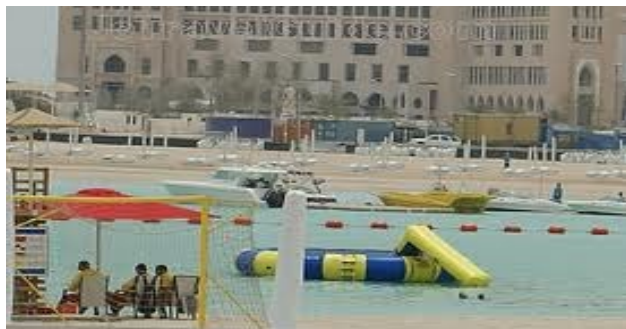
Katara Cultural Village