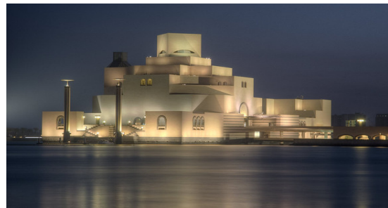
Islamic Art Museum