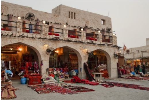
Traditional Market (Souq Waqif)