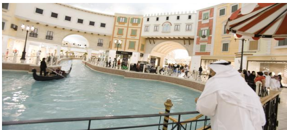
The Villagio Mall