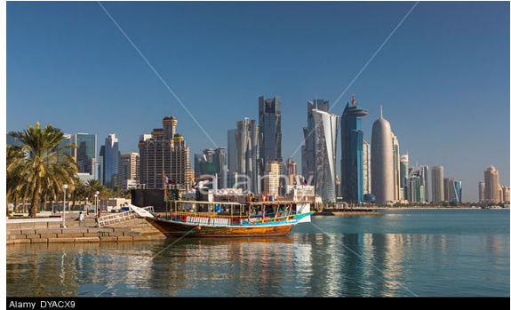
Dhow rides off the Corniche