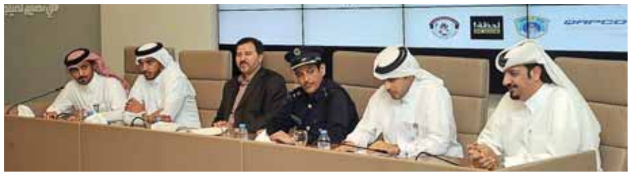
Officials at the launch of the campaign.

"Our contribution to society cannot be overstated. We are pleased to be a key partner on